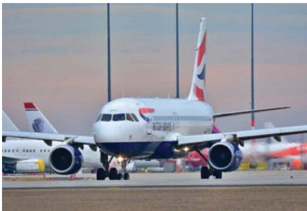
Figure 5.1: Video frame a) stego frame b) original frame c) encrypted frame

video sequences to investigate the f measures. Shows a video frame with a 60 bit secret message embedded (left) and original frame (right), as well as the encrypted frame in 5.1c. This sequence containing 100 frames is taken from a sample cookie video. The Loss probability indicates the loss of packets in transmission in CVM the loss probability as same as QDM as we are dealing with security phase only hence two more parameters are same as QDM in CVM the video quality is same as QDM and the Time of transmission for the video in multicasting. The rest parameters are related to video encryption which we can improve to demonstrate the CVM. The video cryptography is broadly characterized in several algorithms enlist Fully Layered video cryptography permutation based video cryptography selective encryption. In CVM we used selective encryption as mentioned in section 4.1 we have selected any of four frames and applied encryption on the selected frames. Below table shows the comparison table of algorithms the parameters for fully layered and permutation based algorithms are referenced from the research of jolly shah and vikas saxena [8] and CASM content aware secure multicast algorithm parameters are referenced from the Hao Yin and other authors [2] and CVM parameters are calculated by the experiment performed. Where VD stands for Visual degradation, ER for Encryption ratio and Speed of Encryption denoted by Speed.